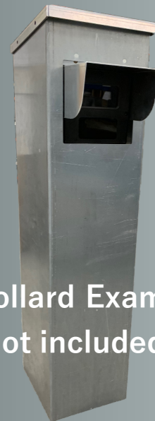
Bollard Example (not included)

High Quality images 24 hours a day, accurate plate reading. A range of interfaces allowing users to connect and use their own management software.